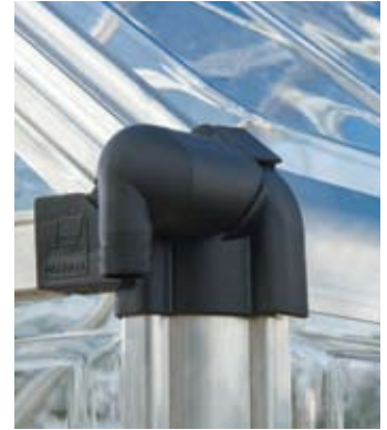
Gutter system allows you to drain rainwater