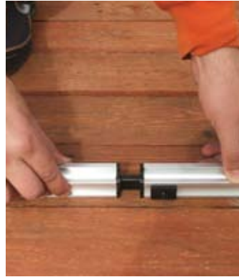
SmartLock™ connectors screws free