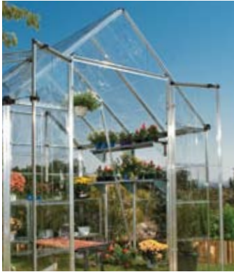
Extra wide doors provides easy access - 118cm / 45½"